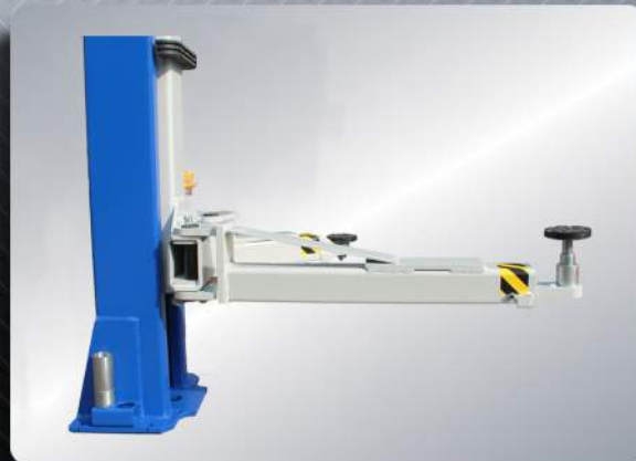
Rubber Door Guards and Spin Up Pads with Stackable Adapters