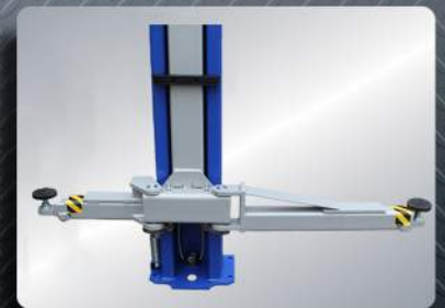
180° Front Arm Rotation